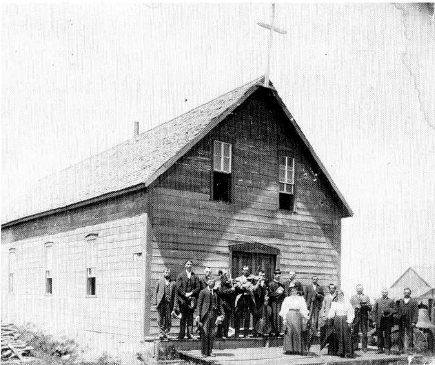
Early Catholic church in Lambert